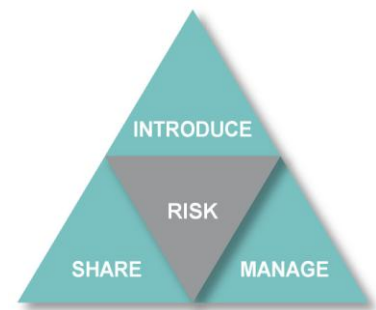
Figure 4.0 - Asset Grouping

A single third-party entity can represent all of these areas at the same time and impact the organization’s overall risk posture. The first step to understanding the risks posed by third parties is to know the scope of the business relationship or service provided by the third party. To identify every applicable third party, an organization should study their CHD flows and any business processes involving CHD. In addition, an organization should consider third parties that are involved in the development, operation, or maintenance of their CDE (even those who do not directly handle cardholder information could still indirectly have an impact on the organization’s CDE). Some examples of third parties and/or service providers to consider include: